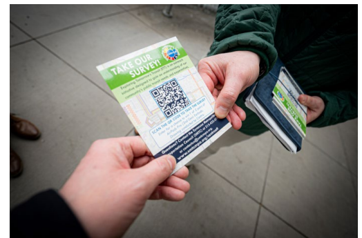
SMTC staff distributed "Take Our Survey!" cards at the Centro Hub in April 2023.