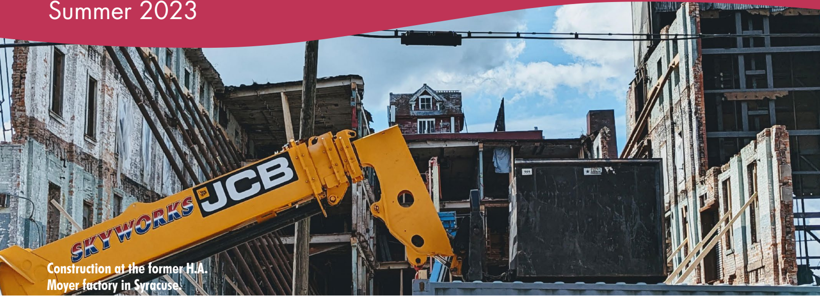
Construction at the former H.A. Moyer factory in Syracuse.

THE NEWSLETTER OF THE SYRACUSE METROPOLITAN TRANSPORTATION COUNCIL Summer 2023